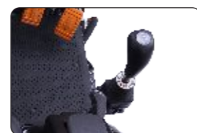
Single Joystick with Positive Locking System (Comfortable Positioning for Operation)