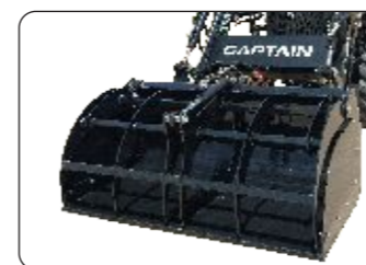
Grapple Fork Bucket