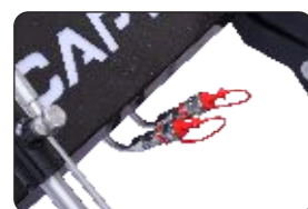
3rd Function Valve