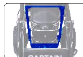
Unique Additional Rectangular Support Crossbars all Across the Loader