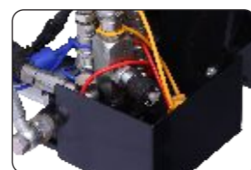
Flow Control Valve on DCV to Control Dropping Rate of Loader Boom