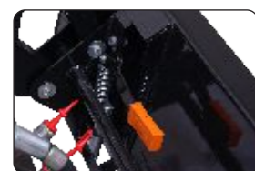
EURO Type Quick Hitch with Lever

CAPTAIN LOADER specifically designed to maximize the performance of the front loader and tractor. They offer a high lifting capacity, perfect for landscaping or light utility work. The Captain Loader operates with single joystick control and has quick & easy attachment and detachment of bucket.